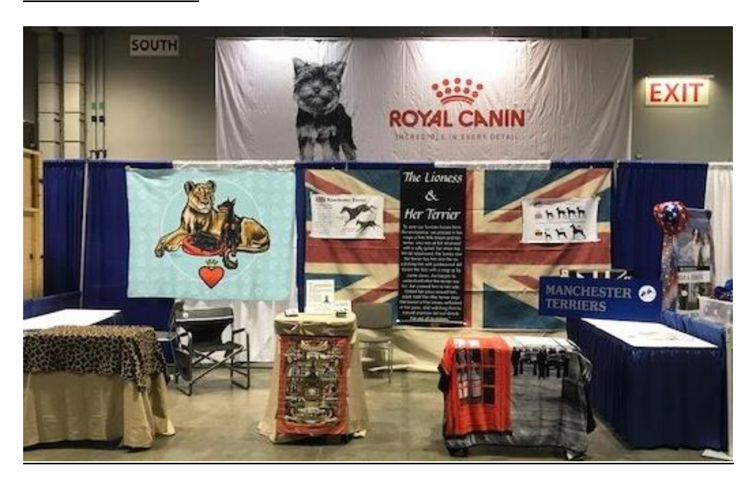
Booth at Royal Canon, December 2018