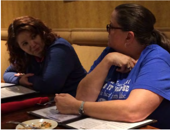
Lexington Show pictures