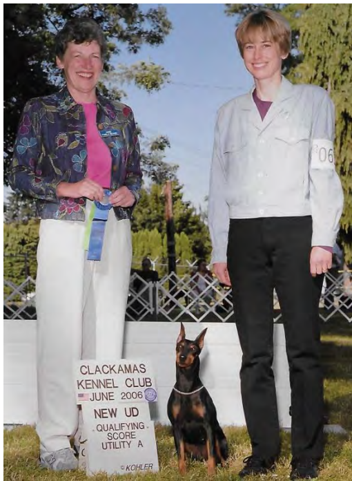
Mō and Gypsy finishing Their Utility title