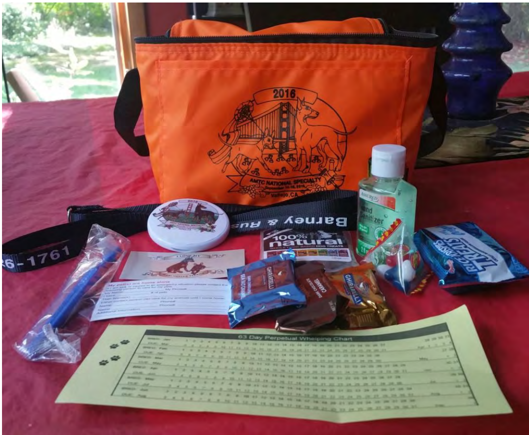
Swag Bag”