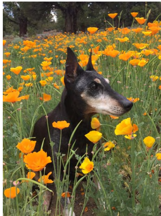
Gypsy in the poppy field