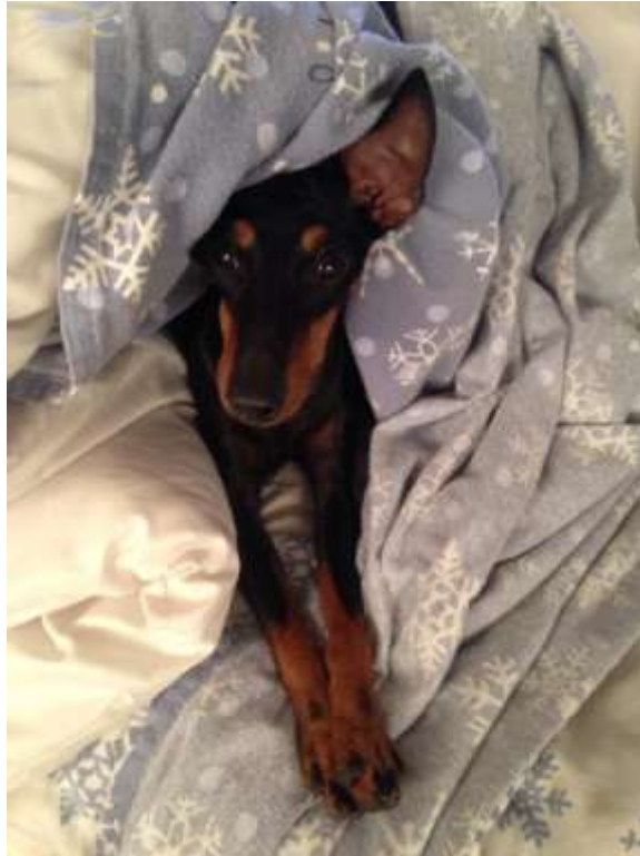
Posh - Burmack's Uptown Girl at Newbeg - is Covered up! (Submitted by Rachel Bring)