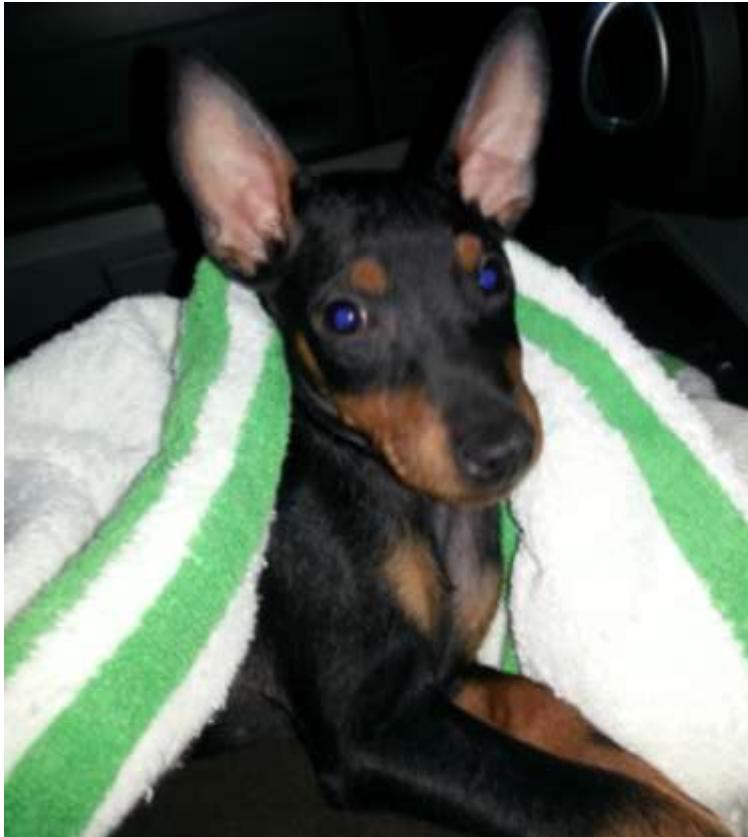
Wilbur is Covered Up!