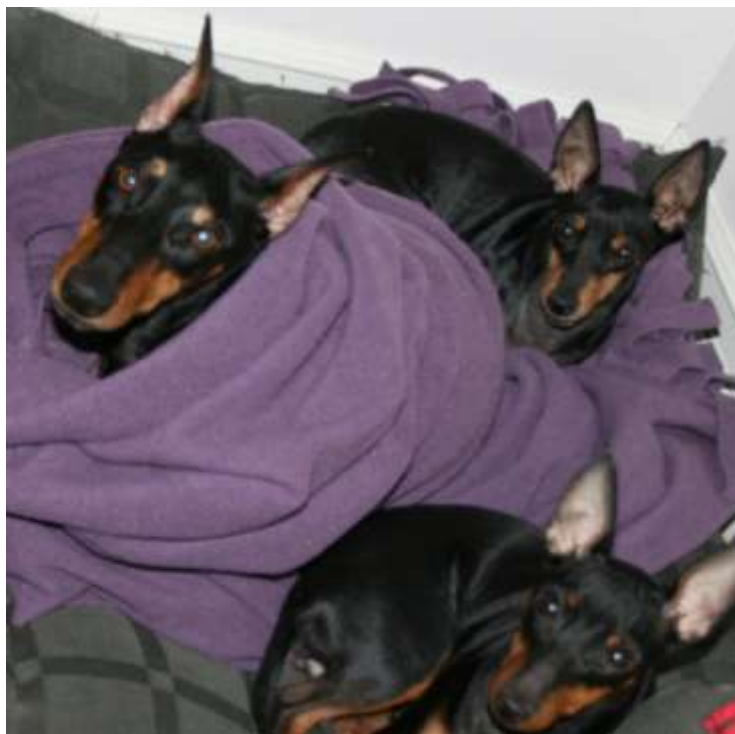
Three are Covered up!