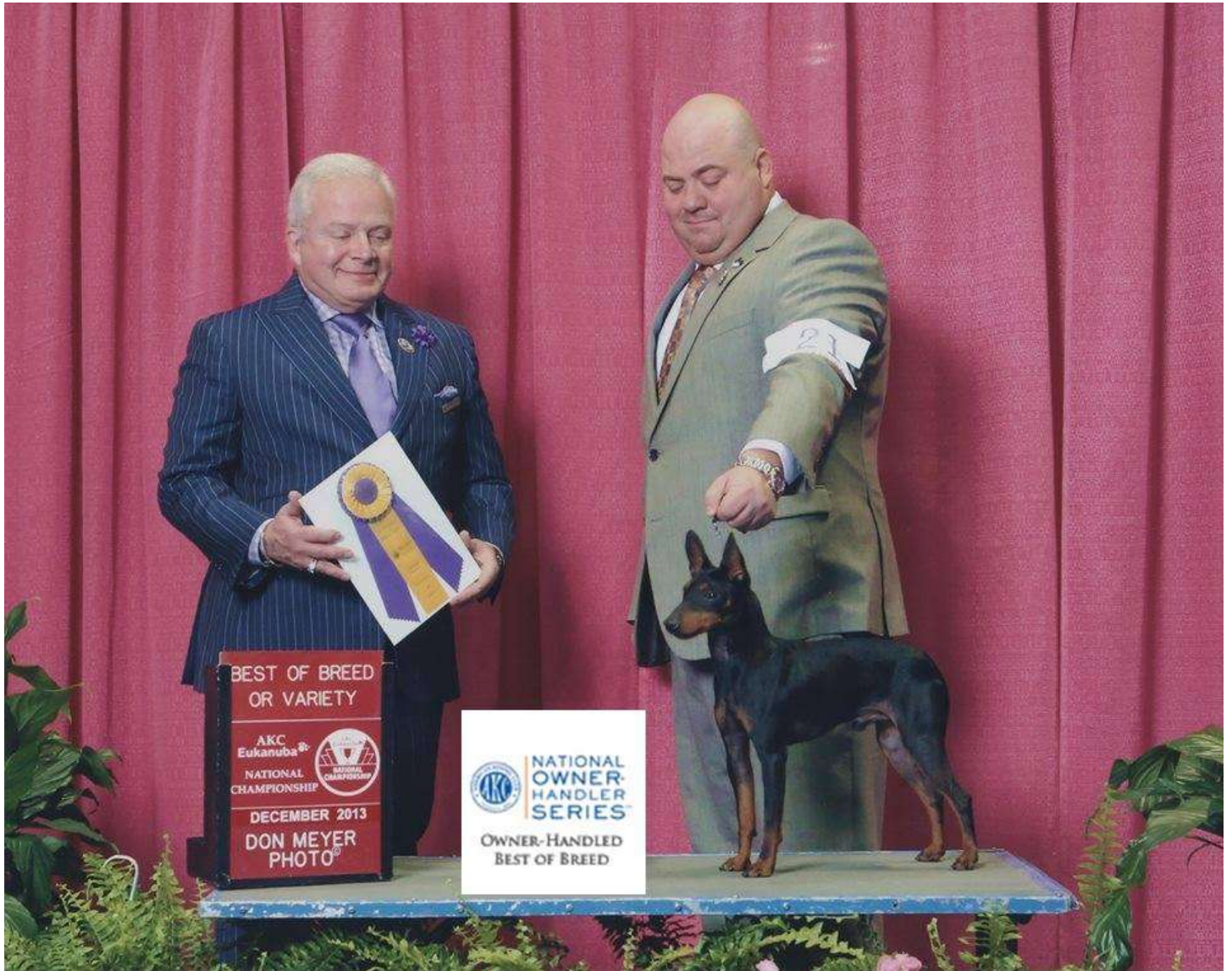
2013 Best of Breed Eukanuba Owner Handler Series - "Wilbur"