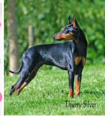
Ch Witchstone Party Politics