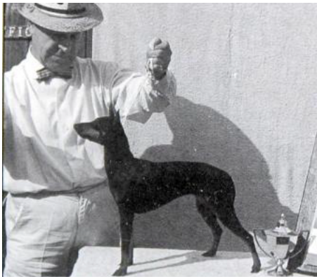
Ch Stealaway Golden Girl