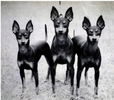
3 Caesarea Champions

The 1980's and 90's saw a significant change in the ETT world. Many of the breed 'stalwarts' from the past retired from breeding, showing and judging, and several of the best known ETT kennels either wound down or ceased to operate. This was accompanied by the emergence of several new ETT kennels and exhibitors who brought new thinking, new skills and an infusion of new blood into the breed.