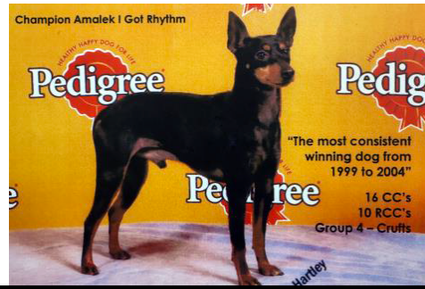
Ch Amalek I Got Rhythm