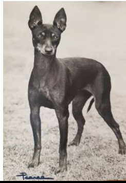
Ch Reeberrich Scarlett