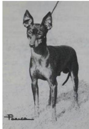
Ch Quinoa Country Gent