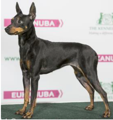
Ch Sharex Burning Love For Dobrugh