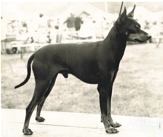
Ch Lancer of Leospride

The change of name, and the introduction of new members, gave fresh impetus to the club, and there was clearly a healthy appetite for change. The Club established an ad-hoc "Reformative Committee" to deal with many aspects of the operations of the club. Within short order there was agreement that the Club should double the size of its management committee (from 6 to 12) and introduce new appointment and rotation procedures, that a Publicity Committee should be formed (with a budget to pay a PR adviser), that a regular newsletter should be produced, that club shows should be established, that the club rules should be thoroughly revised, that a sub-committee should be established to investigate alleged breed defects, and (somewhat controversially) that the Breed Standard should be revised and modernised.