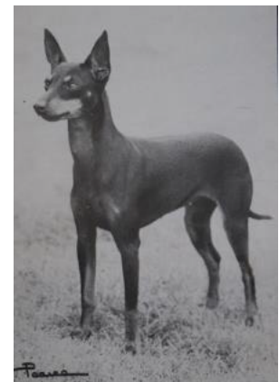
Ch Brynlyth Tannia