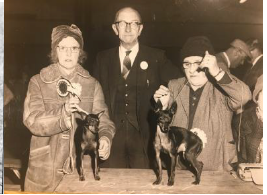
Ch Quaker Girl, Ch Flute Of Lenster