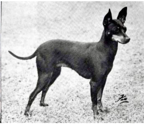
Ch Bordesley Bowbells