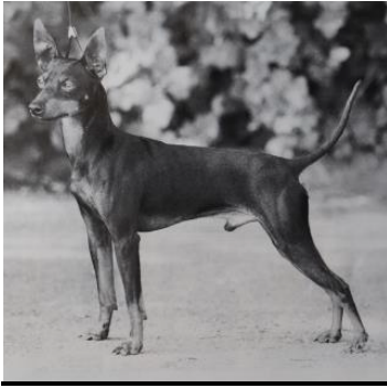
Ch Eburacum Gold Strike