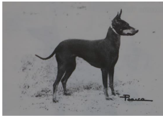
Ch Caesarea Dolphina Star