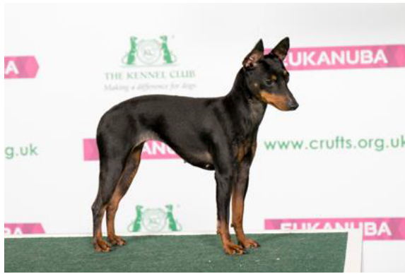
Ch Witchstone Minnehaha