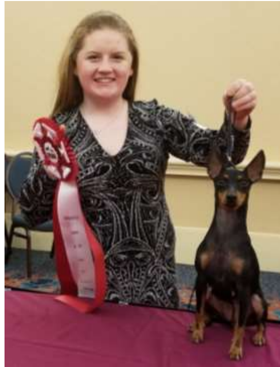
First picture - CH SunKissed Faith is greater than your Fear winning Manchester breed puppy stakes at Royal Canin - Second picture - Group winning, MOHBIS winning, Multiple variety group placing, GRCHS. Passport Sea Air was awarded runner up Manchester of the year and inducted into The AMTC Hall of Fame