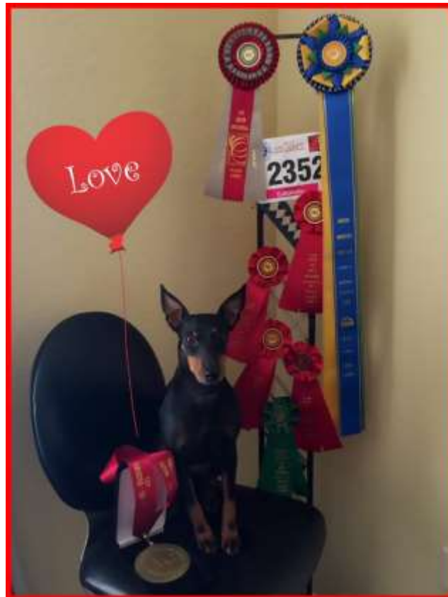
This is Tippsy, GrCh MACH2 Jetcity Southern Comfort. She won High Agility Manchester at the Agility Invitational and made the Finals.