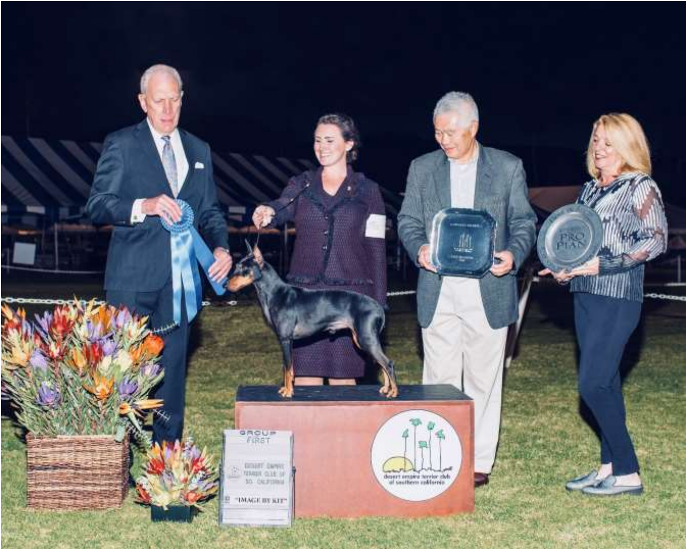
GCHS Nobles Random Reaction at Toria

I'm a little late in posting, but the 2017 stats are out. Number One All Systems. Riot has achieved the unthinkable at only two and a half years old. In 2017 he attained 45 group placements. Including 10 Group Ones, a Reserve Best in Show and a National Specialty Best in Show. He went from a champion to 100 points shy of his Gold Grand Championship. He also was voted Standard Manchester Terrier of the Year.