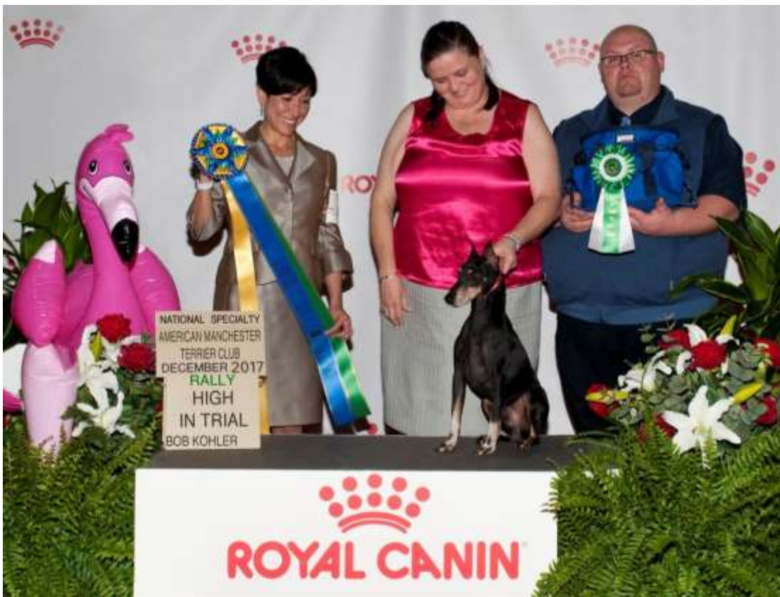
BISS GCHS Wilane's Midnight Rydor RN RI HOF